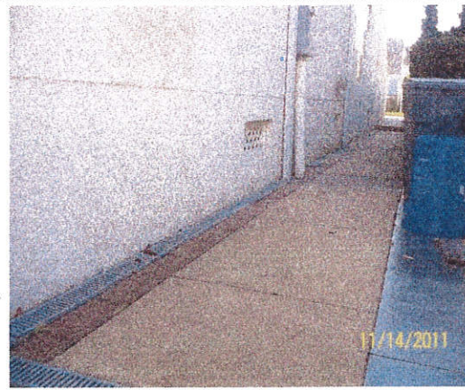
Left Side View – Date of Photograph: (See Photo Stamp)